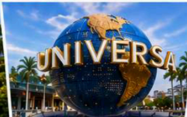
UNIVERSAL STUDIOS SINGAPORE