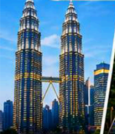
PETRONAS TWIN TOWERS