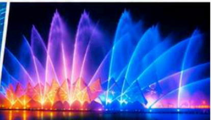
WINGS OF TIME LIGHT & WATER SHOW