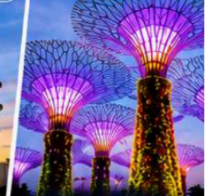
GARDENS BY THE BAY