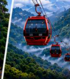
GENTING HIGHLANDS CABLE CAR